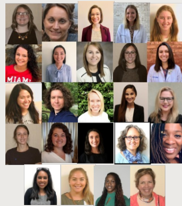
Photo caption: 2020-2021 LEND trainees

This LEND year looks a bit different than in the past due to COVID-19, but is going well so far. We have 24 trainees who are working hard to get the most of the program.