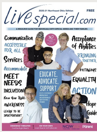
Photo caption: livespecial.com magazine cover