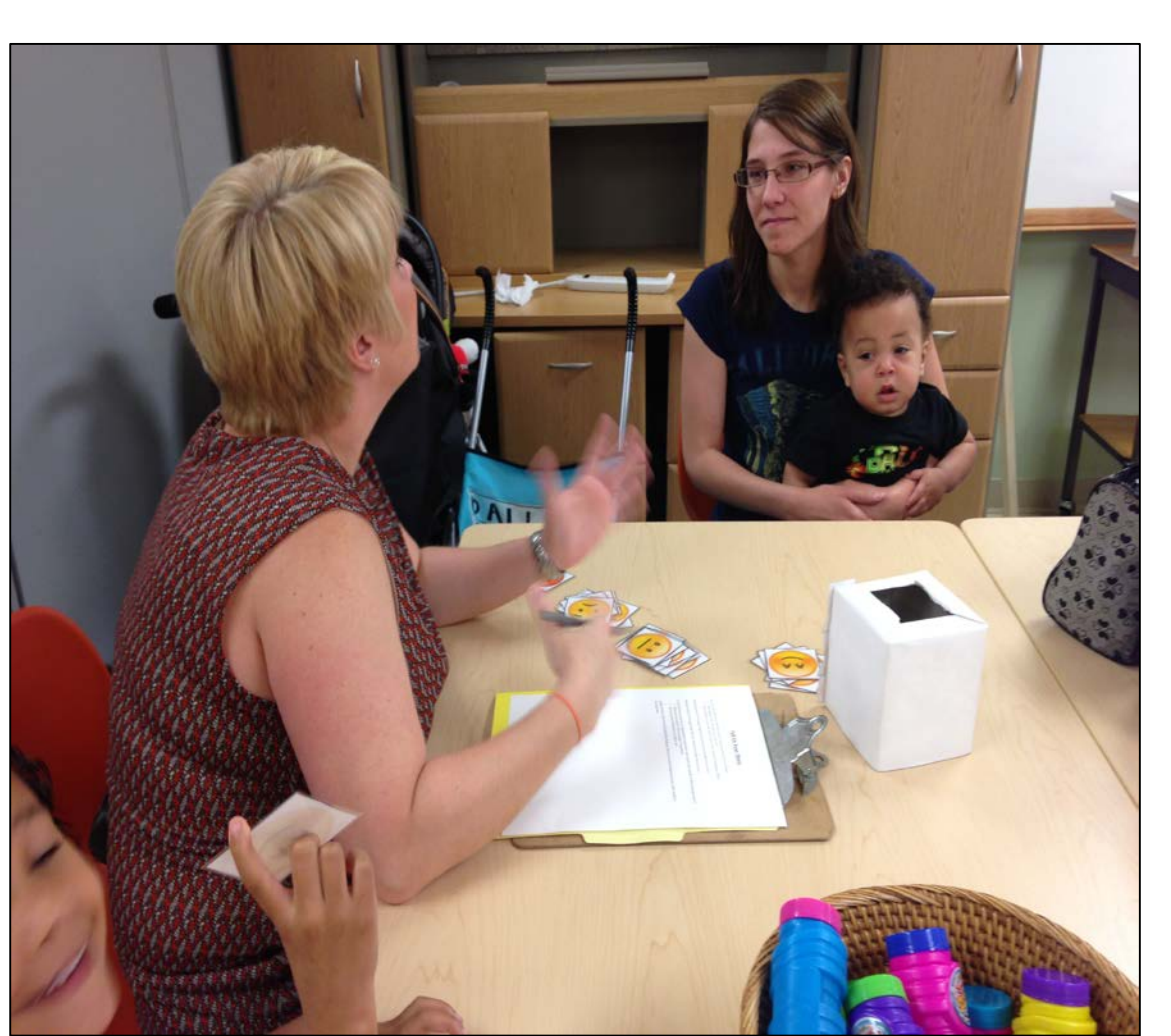
Figure 3. Summary of feedback about the TALI pilot study from professionals and family members of children who participated in the intervention.